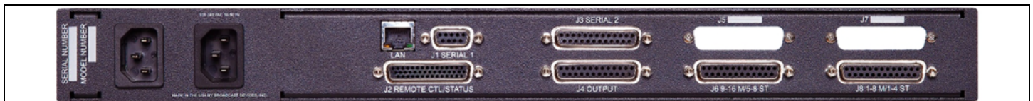
RAS-208 and RAS-216 Passive Audio Switcher rear panel