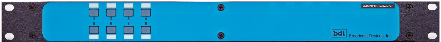
RAS-208 Eight (8) Channel Stereo Passive Audio Switcher front panel

RAS-208 Eight (8) Channel Stereo Audio Switcher RAS-216 Sixteen (16) Channel Monaural Audio Switcher